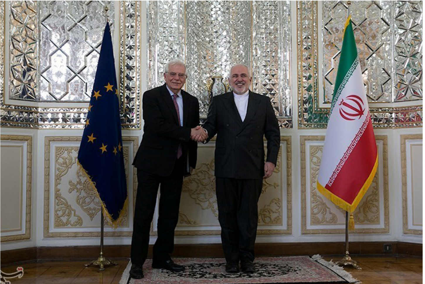
Iranian Foreign Minister Javad Zarif shakes hands with High Representative of the EU for Foreign Affairs and Security Policy and Vice-President of European Commission Josep Borrell in Tehran, Iran, February 3, 2020.

When the United States unilaterally quit the JCPOA, it lost a channel for direct conversation with Iran through the agreement's Joint Commission, which is chaired by the European Union's high representative for foreign policy. The so-called E3—the United Kingdom, France, and Germany—retain seats on the commission as well as diplomatic links with Iran and have sought to preserve the JCPOA despite steps from the Trump administration and Iranian countermeasures. Following the US election, the E3 is now in a position to again fill the breach alongside the European Union (EU). History has shown that when the United States and Europe coordinate policies toward Iran, real progress is more achievable.